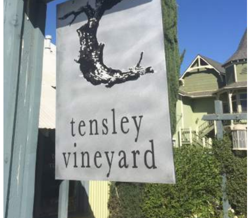
At last we have a tasting room sign!